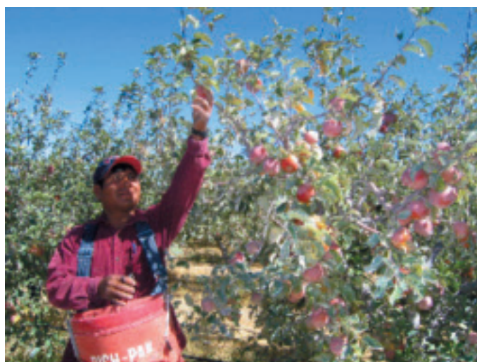
CHECKING THE FRUIT - An employee examines apples at Johna's Orchards in Tehachapi, Calif. The trees flourish with AGGRAND natural liquid fertilizers.

Johna's Orchards has been in business since 1978 and became organically certified in 1998.